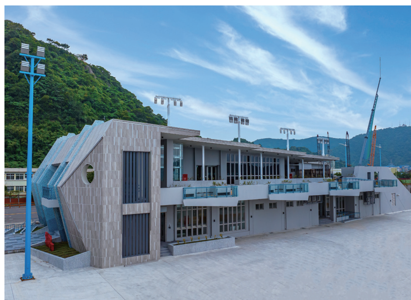
Suao Passenger Terminal