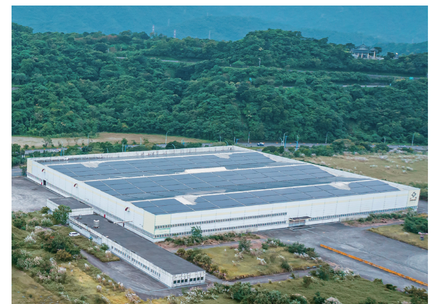
Free Trade Zone Warehouse