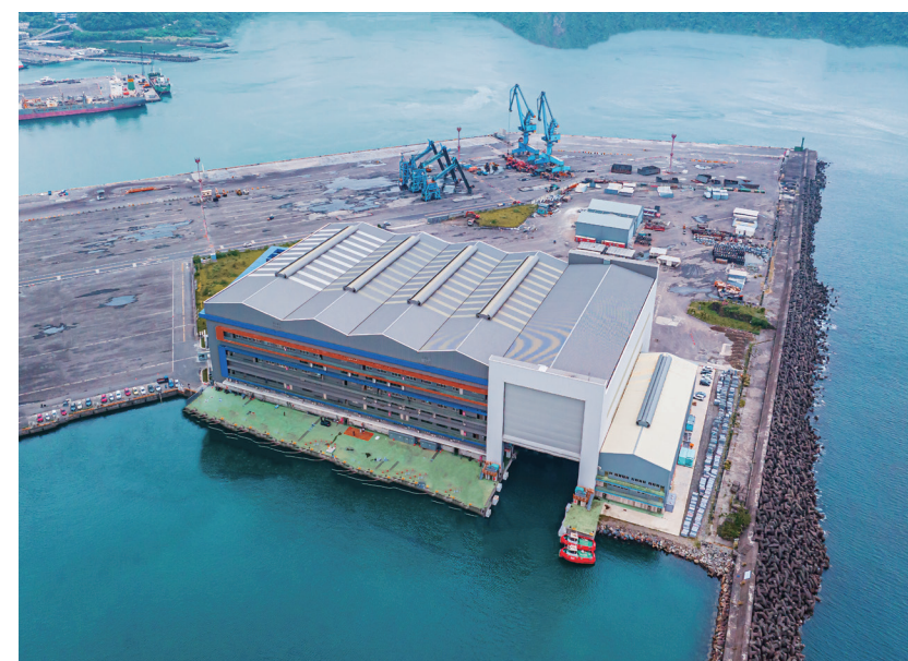
Yard No.6 of Lungteh Shipbuilding Co., Ltd.