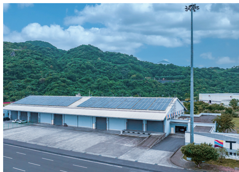
Warehouse No. 15